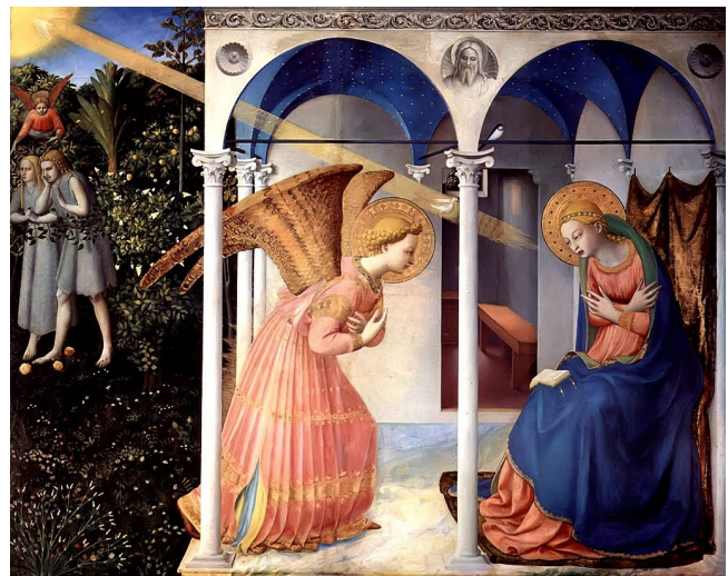
The Annunciation - Painting by Fra Angelico