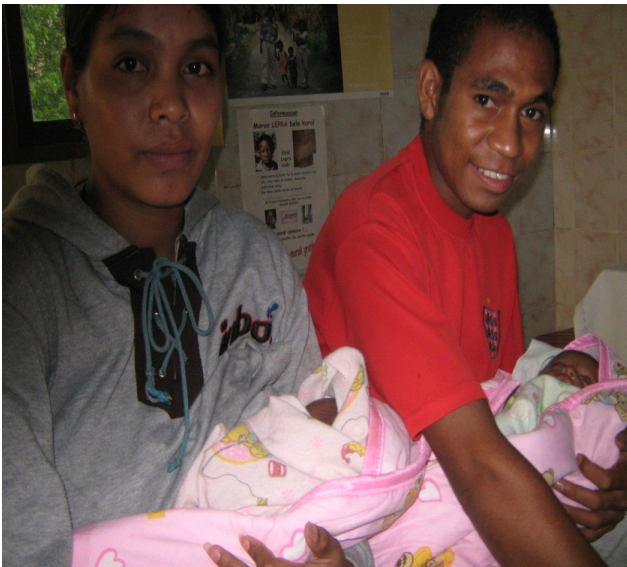
On behalf of our people, these babies are twins, both male, and the father looks very happy.

Thanks for the love and support you have given to the mothers and babies through Maria Auxiliadora Clinic at Venilale - Baucau, Timor Leste.