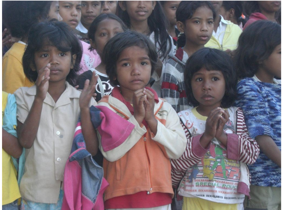
Children at the Orphanage, Venilale, East Timor

are held on the 1st & 3rd Sundays of each month at 11:30 am or at any of the Parish Masses on the 2nd, 4th or 5th Sundays. A compulsory preparation night for parents takes place on the first Tuesday of each month in the Parish Community Centre at 7:30 pm.