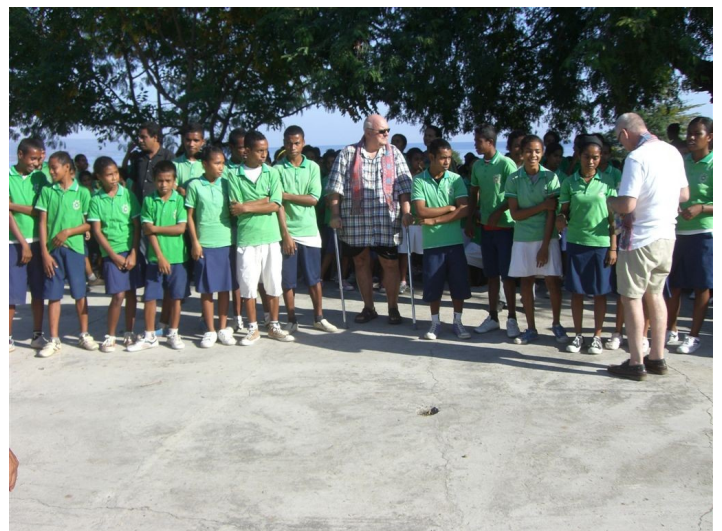
Nunira students at Laga Secondary School (St. Anthony)